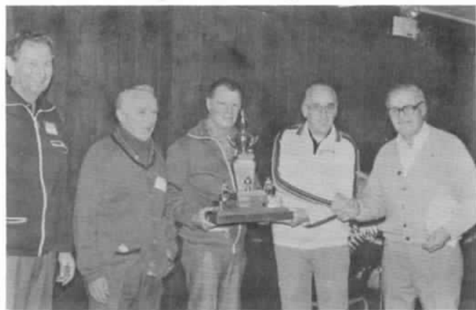
Hutcheon Event - Dean 1963-1964